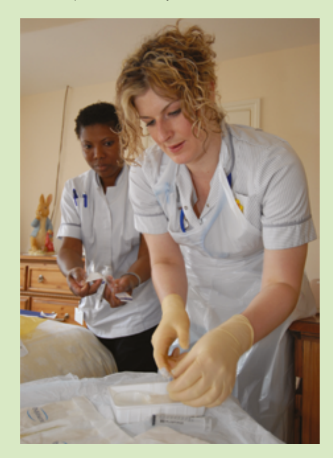
You need very good interpersonal skills and a wide knowledge base

During the various placements on my degree course, I realised that working in the community came closest to my idea of what nursing is about. In my last community placement as a student, I was given my own caseload to work with under supervision. I really loved it.